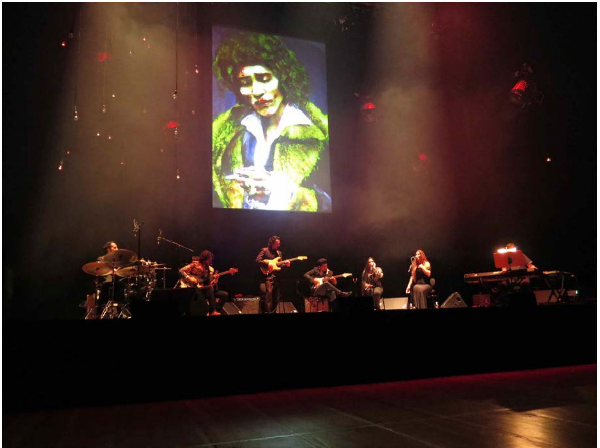
Première at Dresden /Festspielhaus Hellerau /April 9 th 2016